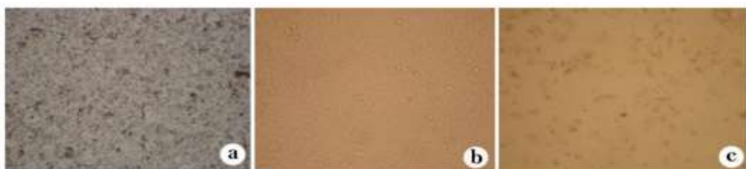
Fig. 2(a). Normal HeLa cell line (b) HeLa cell line treated with methanol extract of E. alsinoides at (400 \mu\text{g/ml} ) (c) Normal Hep 2 cell line