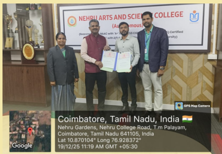
Coimbatore, Tamil Nadu, India Nehru Gardens, Nehru College Road, T.m Palayam, Coimbatore, Tamil Nadu 641105, India Lat 10.870104° Long 76.928372° 19/12/25 11:19 AM GMT +05:30

Central for International Affairs in association with Center for Industrial Relations and Academia have signed MoU with INTI International University Malaysia on 18.12.2025. this MoU will help our institution for joint publication, Research, students and staff exchange program