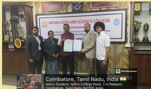
Coimbatore, Tamil Nadu, India Nehru Gardens, Nehru College Road, T.m Palayam, Coimbatore, Tamil Nadu 641105, India

Addon MoU signed with Hacktivate Cyber solutions Pvt Ltd, Coimbatore