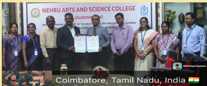
Coimbatore, Tamil Nadu, India

Central for International Affairs in association with Center for Industrial Relations and Academia have signed MoU with INTI International University Malaysia on 18.12.2025. this MoU will help our institution for joint publication, Research, students and staff exchange program