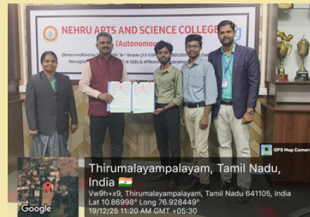
Thirumalayampalayam, Tamil Nadu, India Vr9h+x9, Thirumalayampalayam, Tamil Nadu 641105, India Lat 10.86998° Long 76.928449° 19/12/25 11:20 AM GMT +05:30

Addon MoU signed with Berachah Academy, Coimbatore.