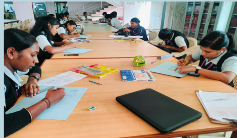
On the occasion of International Mother Language Day. A Drawing competition was organized today by the Department of Tamil. The event featured themes highlighting the significance of the Tamil Language and the rich Culture and heritage of Tamil Nadu.