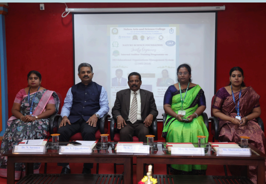
Coimbatore, Tamil Nadu, India Nehru Gardens, Nehru College Road, T.m Palayam, Coimbatore, Tamil Nadu 641105, India

An Internal Auditor Training Programme on ISO Educational Organizations Management System (ISO 21001:2018) was organized by Nehru Arts and Science College (Autonomous), Coimbatore, in association with Nature Science Foundation, on 07th February 2026 at the A Block Seminar Hall.